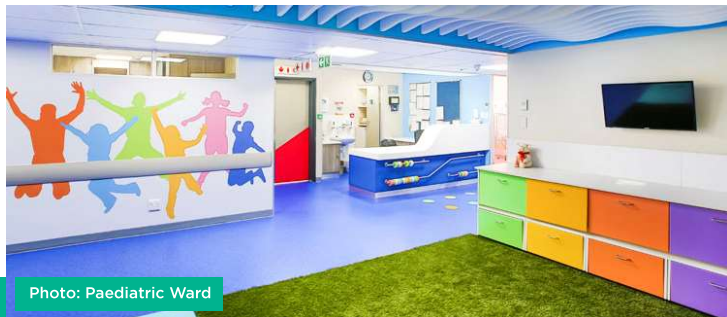
Photo: Paediatric Ward