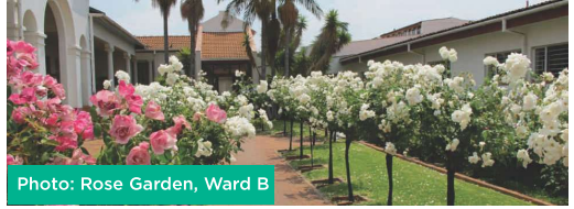
Photo: Rose Garden, Ward B